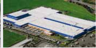
Hörmann KG Ichtshausen, Germany