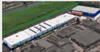
Hörmann Alkmaar B.V., Netherlands