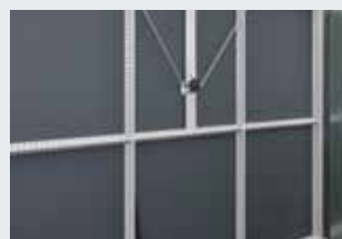
Stable square tube design with reinforcement struts