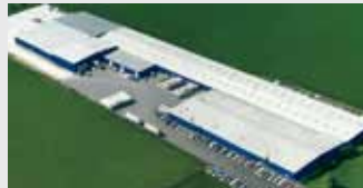
Hörmann LLC, Montgomery IL, USA