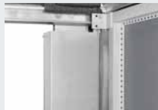
Completely encased counter weights