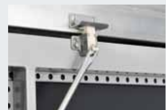
Automatic latching latch lock