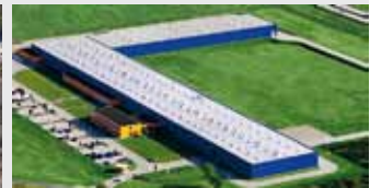
Hörmann Legnica Sp. z o.o., Poland