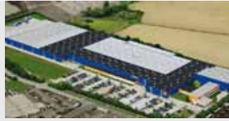
Hörmann KG Brandis, Germany