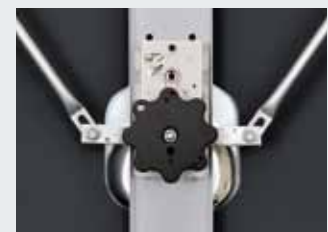
Interior handle, profile cylinder lock, locking rods in the equipment room