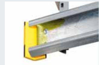
Track ends with shock-resistant cladding