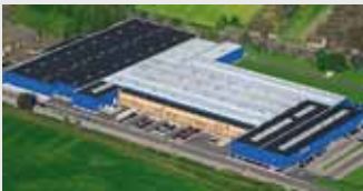
Hörmann KG Werne, Germany