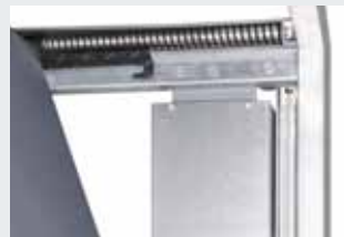
Safe door guidance in vertical and horizontal side guides, slowed opening and closing thanks to the buffer stop