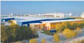
Hörmann Beijing, China