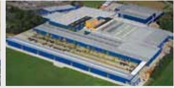
Hörmann KG Brockhagen, Germany