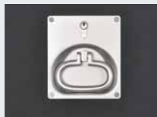
Flush-fitting recessed handle on the hall side