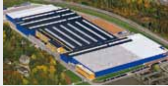
Hörmann KG Eckelhausen, Germany