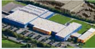
Hörmann KG Antriebstechnik, Germany