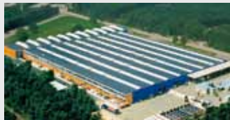
Hörmann Genk NV, Belgium