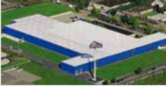
Hörmann KG Dissen, Germany