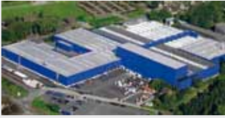
Hörmann KG Amshausen, Germany