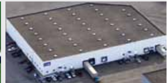
Hörmann Flexon, Leetsdale PA, USA

Hörmann is the only manufacturer worldwide that offers you a complete range of all major building products from one source. We manufacture in highly-specialised factories using the latest production technologies. The close-meshed network of sales and service companies throughout Europe, and activities in the USA and China, make Hörmann your strong partner for first-class building products, offering “Quality without Compromise”.