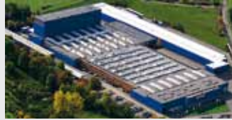
Hörmann KG Freisen, Germany