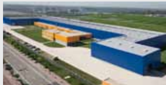
Hörmann Tianjin, China