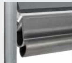
Elastic foot trap protection